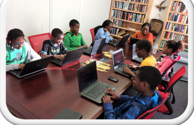
Equipping New Americans